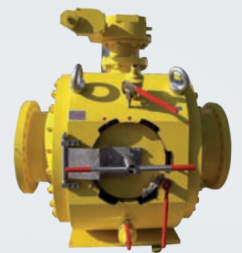
DN 500 PN 50