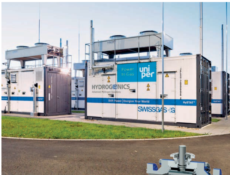
Reference project for innovative energy strategy: Power-to-gas plant “WindGas Falkenhagen” in Brandenburg, Germany