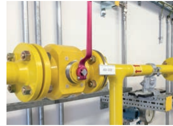
Reliable shutoff: Hartmann ball valves with actuator (upper picture) and manually operated (lower picture)