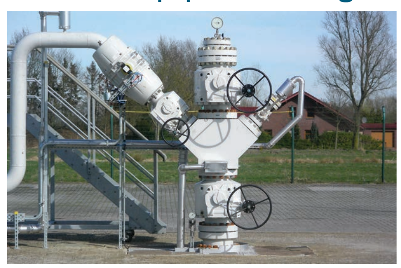
Reliable combination: Hartmann gas wellhead with gas-tight, metallic sealing ball valves in Jemgum, Germany.

With the new build of the storage plant in the Lower Saxony town of Jemgum, EWE Gasspeicher GmbH commissioned Hartmann Valves GmbH to supply all brine and gas wellheads, diverse special ball valves and the associated assembly and maintenance service. The "Hartmann concept", i.e. the use of pure metallic sealing ball valves as wellhead shut-off valves which are absolutely gas-tight even in large nominal bores, had already proven itself in the equipping of other storage plants as highly durable and virtually maintenance-free.